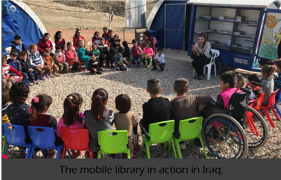
The mobile library in action in Iraq.

Last year we held focus groups with young Syrian refugees living in Za'atari Camp. We really wanted to hear about the activities they would like to see. The children told us that they wanted to be able to read and have access to more books. So, we got to work, using their feedback to design a new project. The mobile library was born!