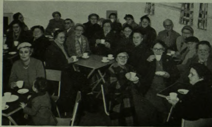
Evergreen Club, 1957