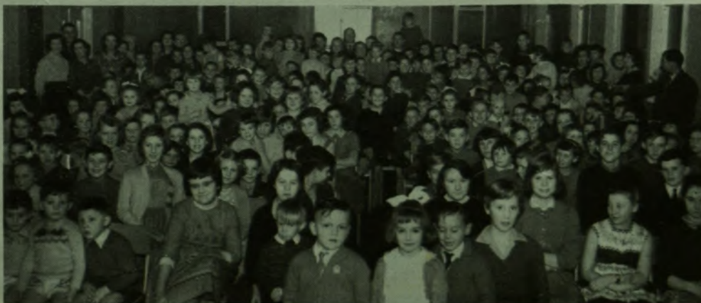
Children's Party, 1959