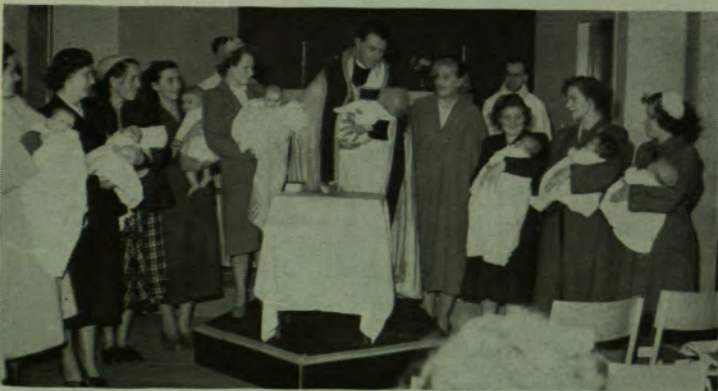
Before we had a font, 1957