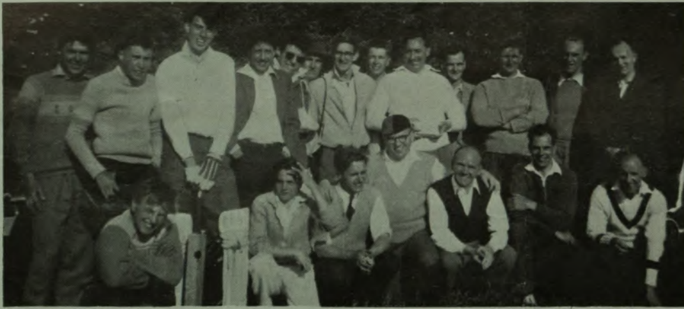
Men and Youth, 1959