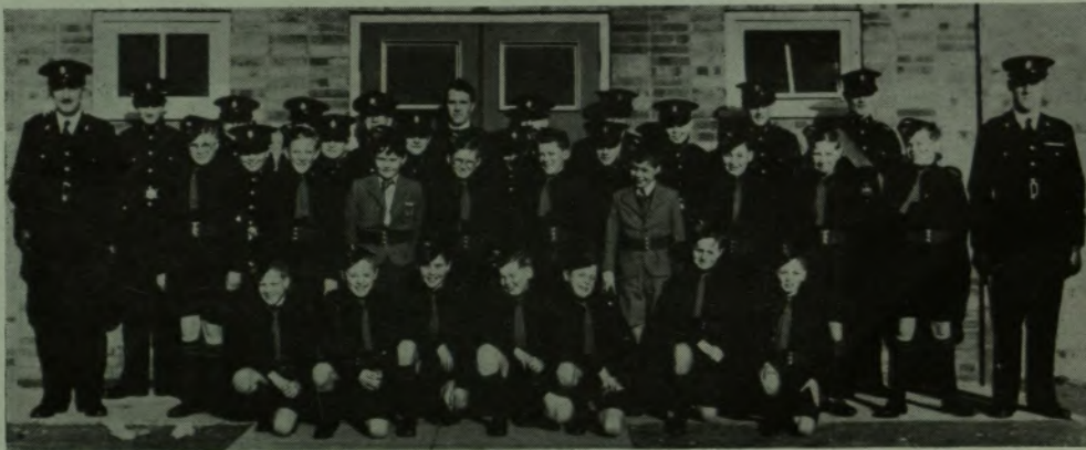
Church Lads' Brigade, 1958