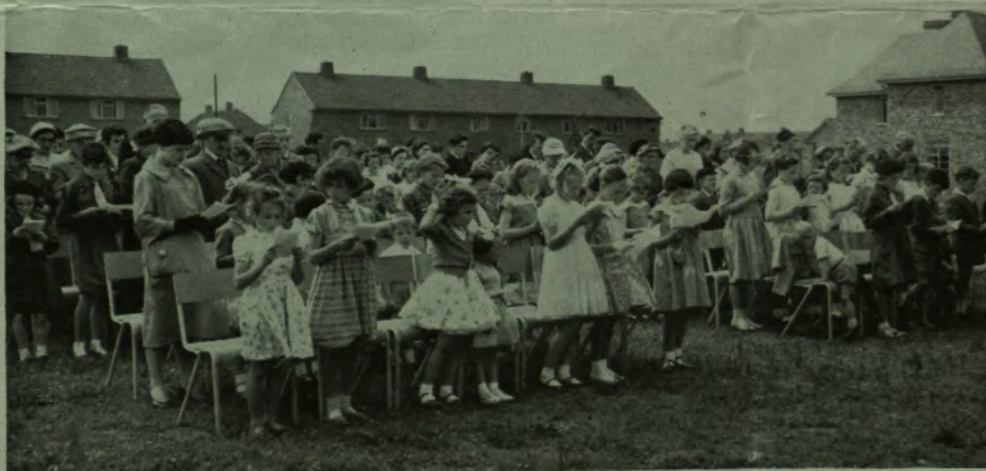
Family Festival, 1958