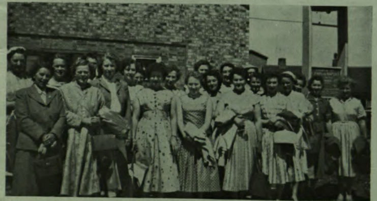
Young Wives' Group, 1957

"You'll get 6 months" to pay for a Dagenite Battery from the